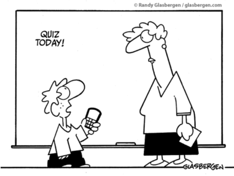
"Once I learn how to use Google, isn't that all the education I really need?"

Do you have questions related to IRB forms, policies/requirements, or review procedures? If yes, please sign up via ULearn to attend a help session intended to provide assistance to anyone who needs help preparing an IRB submission. You are encouraged to bring all of the necessary documentation on a jump drive so that an HSRO staff member may assist you with completing the submission. Sessions are available on alternate Thursdays and prior registration via ULearn is required as space is limited.